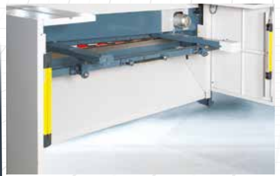
Curtain Light Guards