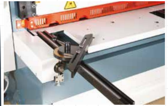
Adjustable Angle Stop 0-180° Finger Guard Ball Transfer Table Hold Downs with Rubber

Backlash-free operation high torques at operating cycles Maintenance free